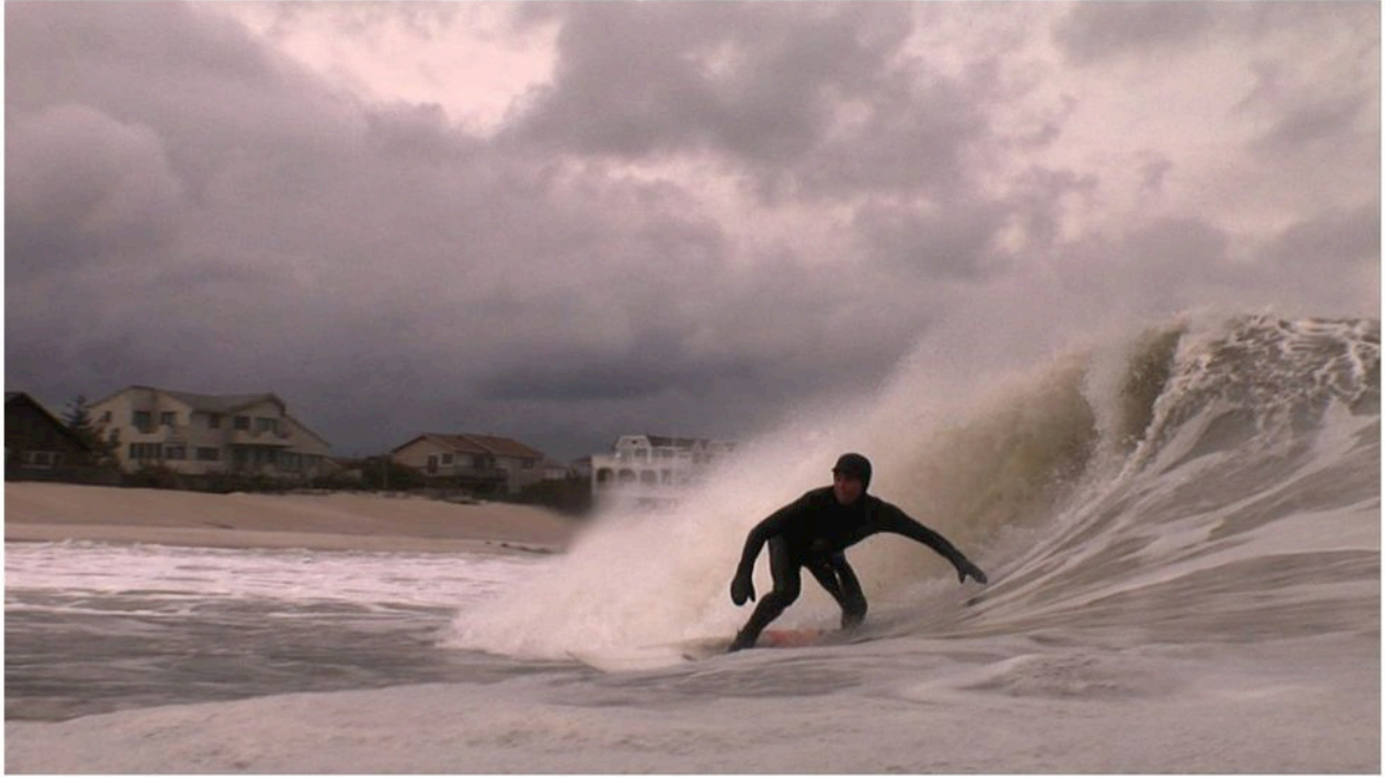
Surfing at Harvey Cedars, Long Beach Island