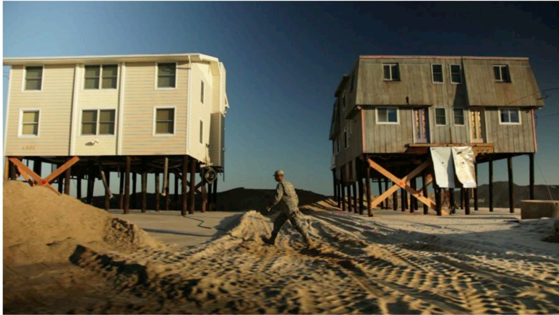
Long Beach Island, Post-Sandy