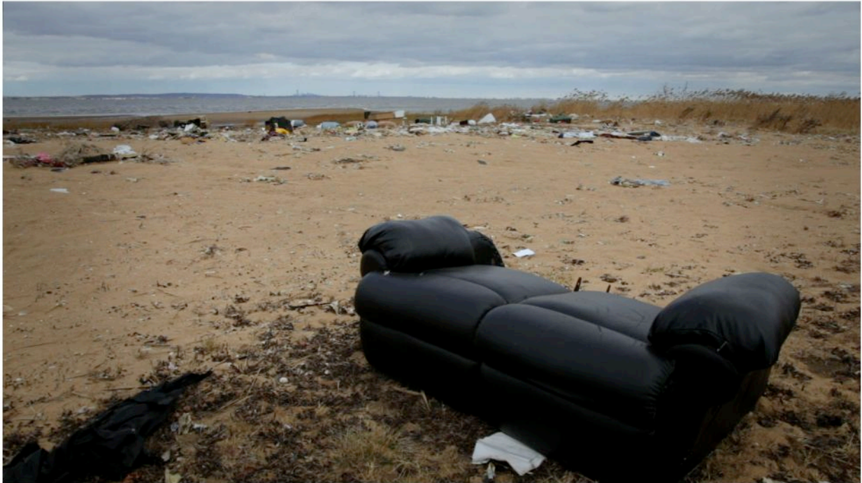
Couch on the beach